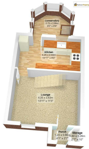
Ground Floor All measurements are approximate and for display purposes only